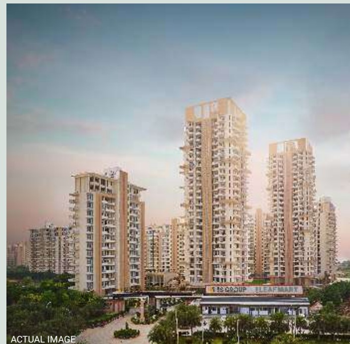
THE LEAF, SECTOR-85, NEW GURUGRAM