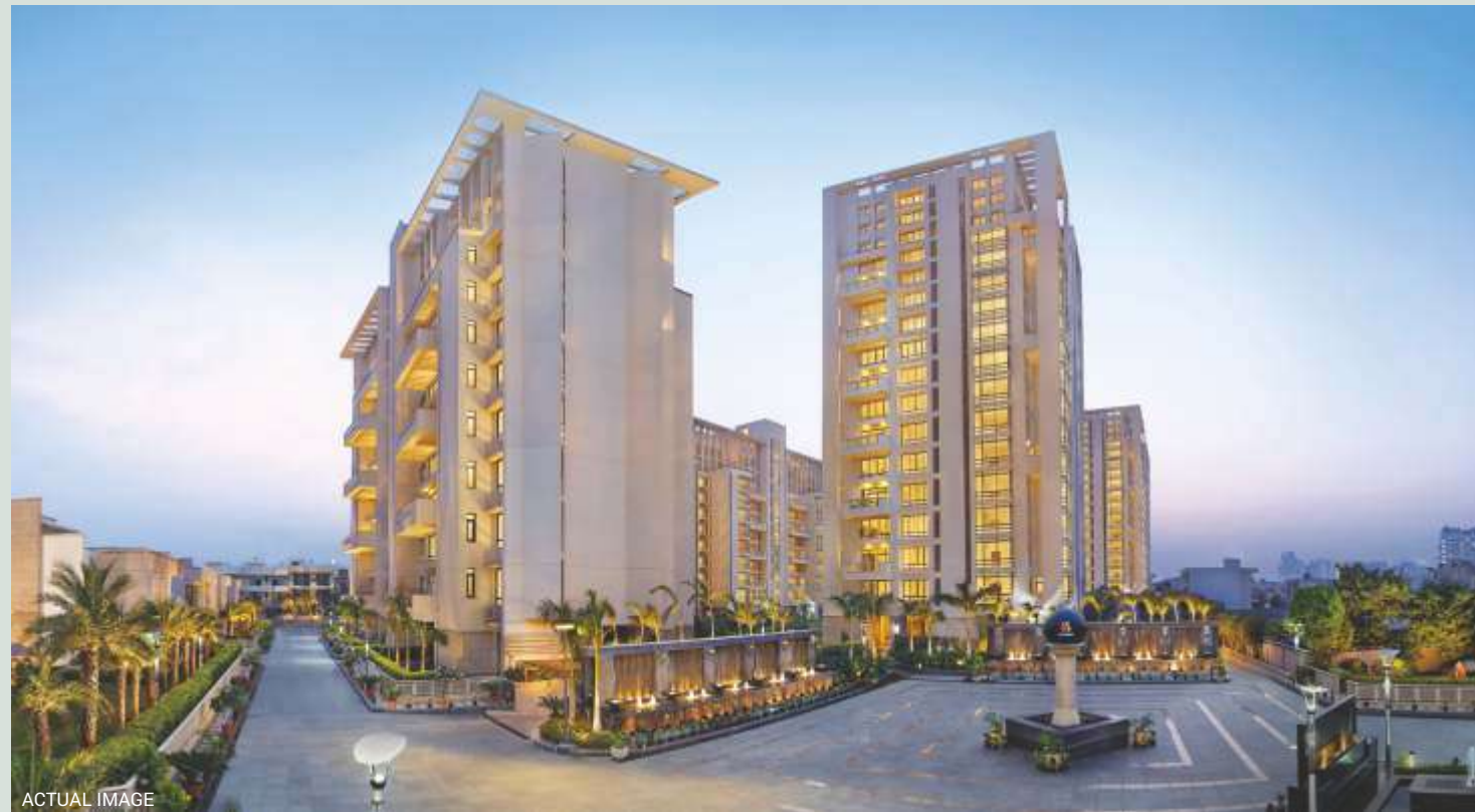
THE HIBISCUS, SECTOR-50, GURUGRAM