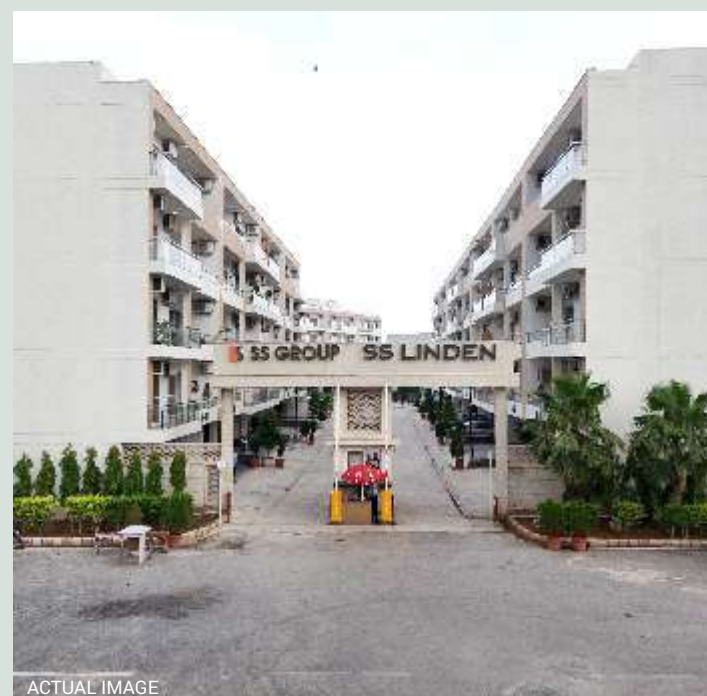
SS LINDEN, SECTOR 84 - 85, NEW GURUGRAM