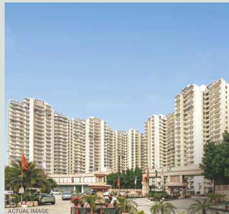
THE CORALWOOD, SECTOR-84, NEW GURUGRAM