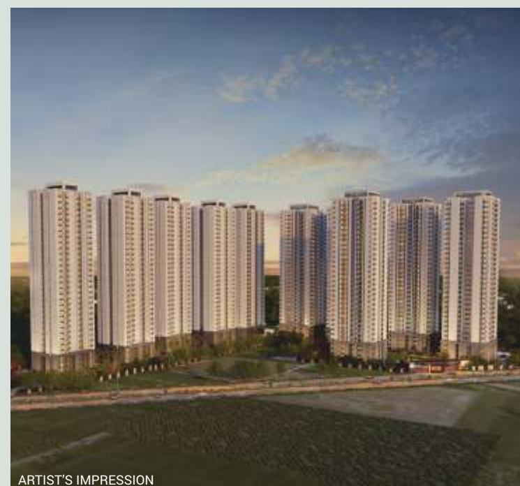
SS CENDANA, SECTOR - 83, NEW GURUGRAM